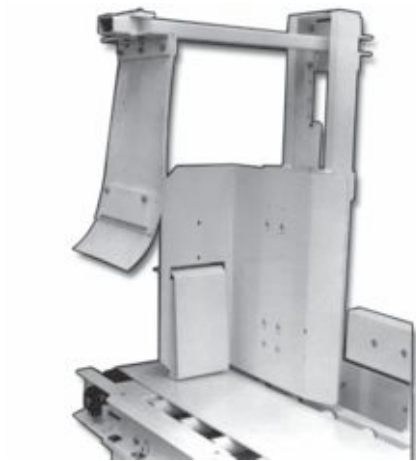
90° All-Pneumatic Bag Transfer